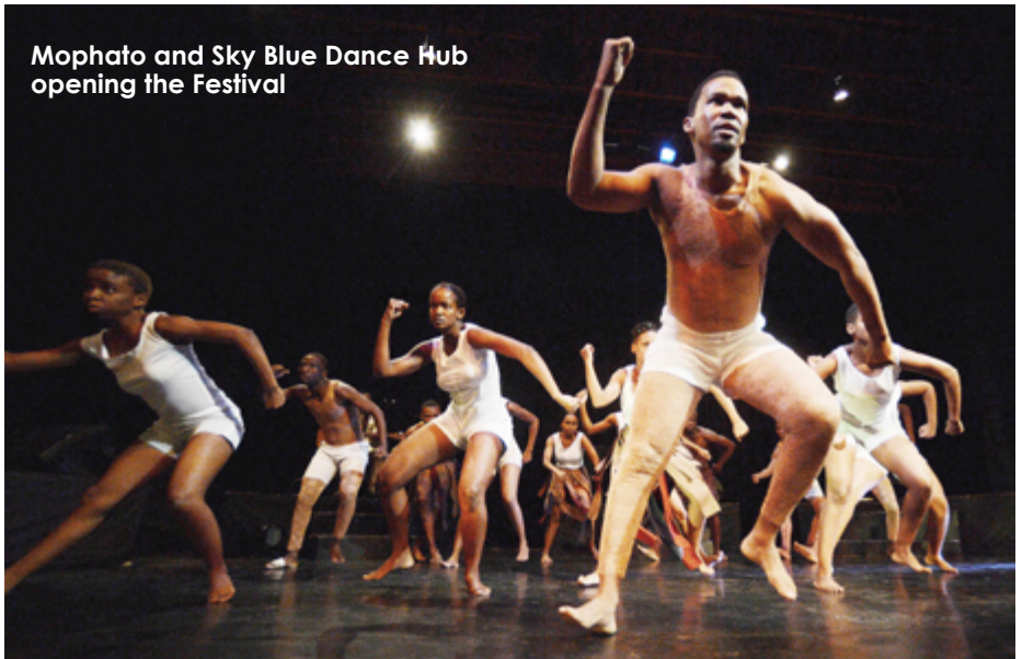
Mophato and Sky Blue Dance Hub opening the Festival